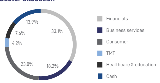
Source: Gresham House Asset Management (portfolio at 31 August 2021)